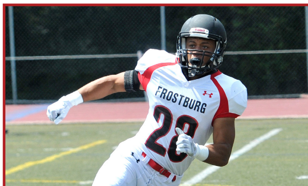
Frostburg plays host to #19 Wesley having won 13-straight games, including 11 straight in the NJAC